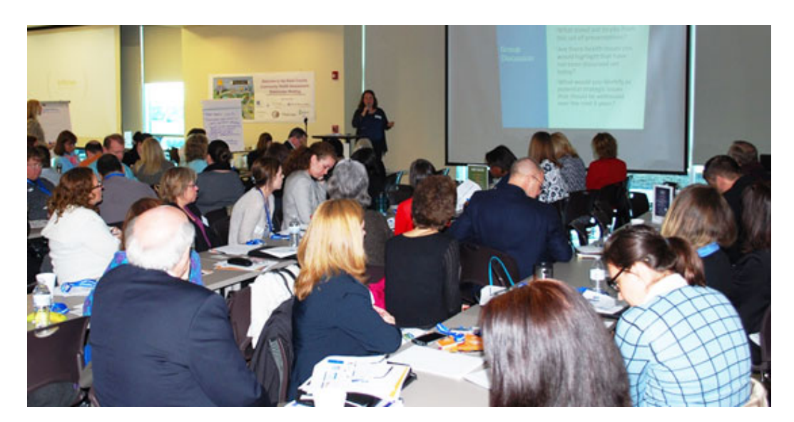
Stakeholders meeting at the Northern Illinois Food Bank to review the Community Health Assessment on April 10.

The strong partnership between the health department, hospitals, INC Board, and other community groups has successfully completed the Kane County Community Health Assessment, or "CHA" for short.